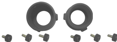
2 Adapters (28mm & 34mm) and 6 Screws